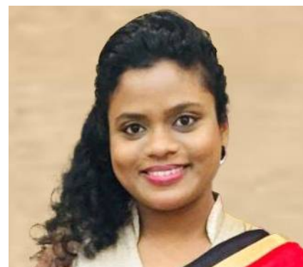
Charani Patabendige Published on Ceylon Today, 09 th April 2022

With that being said, it is crucial to accept such legislation. The Government must educate the public on the threat of online falsehoods and manipulations. As long as people are unaware of the existing threat, they will not take any action swiftly to prevent or counteract it. Being ignorant of the threat is disastrous compared to knowing the risk. Therefore, the Government is duty-bound to take essential actions to educate society. There are many benefits of the Act from a public perspective. The Act will act as a safe point to prevent privacy violations