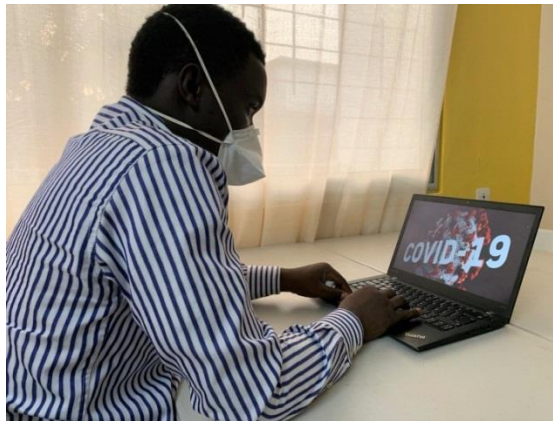
Figure 5- A graphic shared in Hashim's #AgirContreCOVID19 Twitter Chat to stop misinformation.