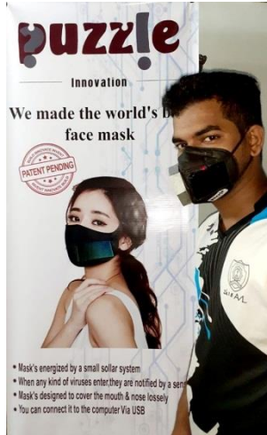
Figure 7- (covid-19-pandemic-an-ideal-opportunity-for-innovation)