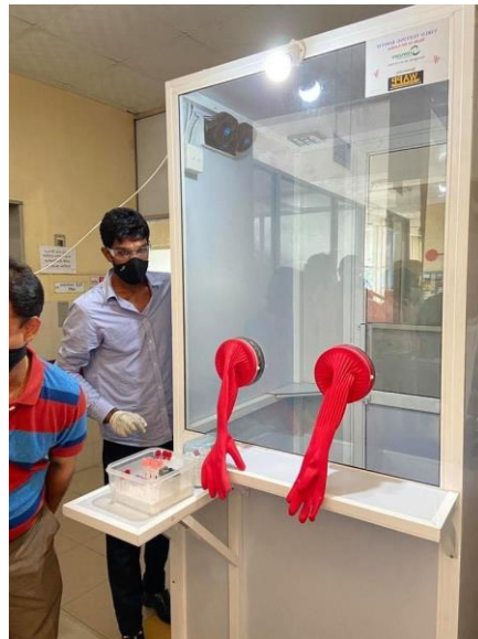
Figure 8- (covid-19-pandemic-an-ideal-opportunity-for-innovation)