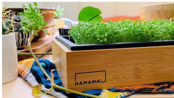
Figure 6-(grow green produce at home- Microgreen kit producer -Hamama )